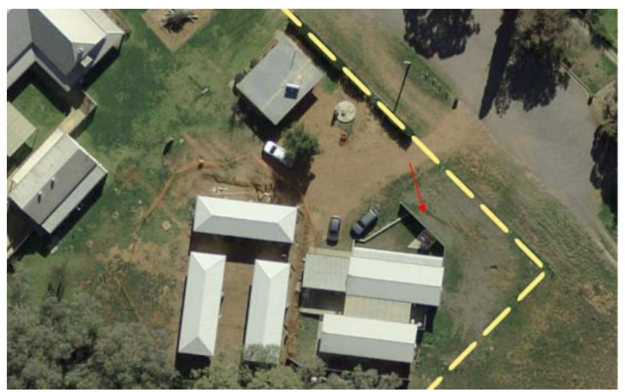
Photo: aerial photo of site at 5-19 Wilson Street Wilcannia May 2021with nominated site of antennae