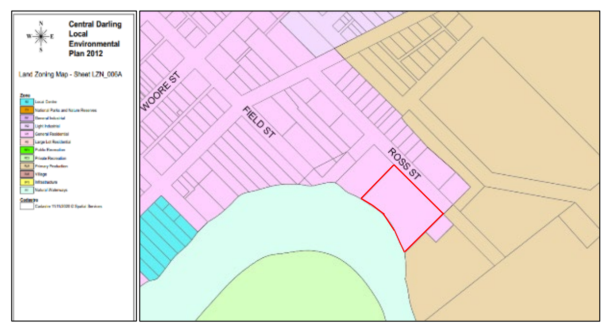
Figure 1 - 7 Ross Street Wilcannia.