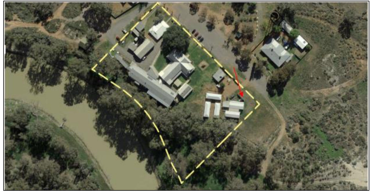
Photo: aerial photo of site at 5-19 Wilson Street Wilcannia May 2021