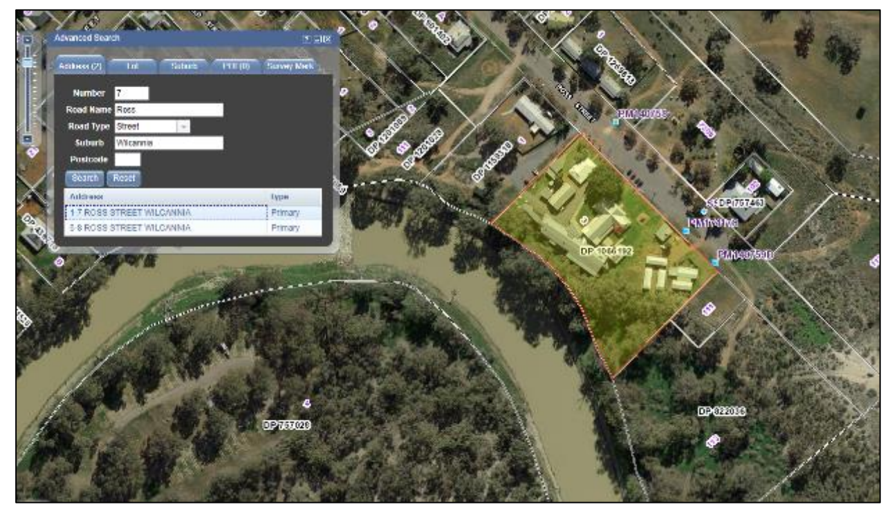
Figure 2 - 7 Ross Street Wilcannia (Source: 6 maps 2021).