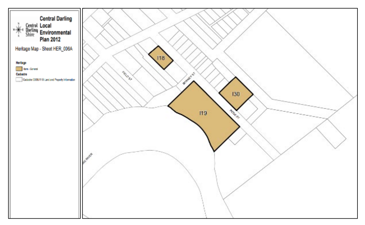
Figure: 3 -1 - 7 Ross Street Wilcannia.