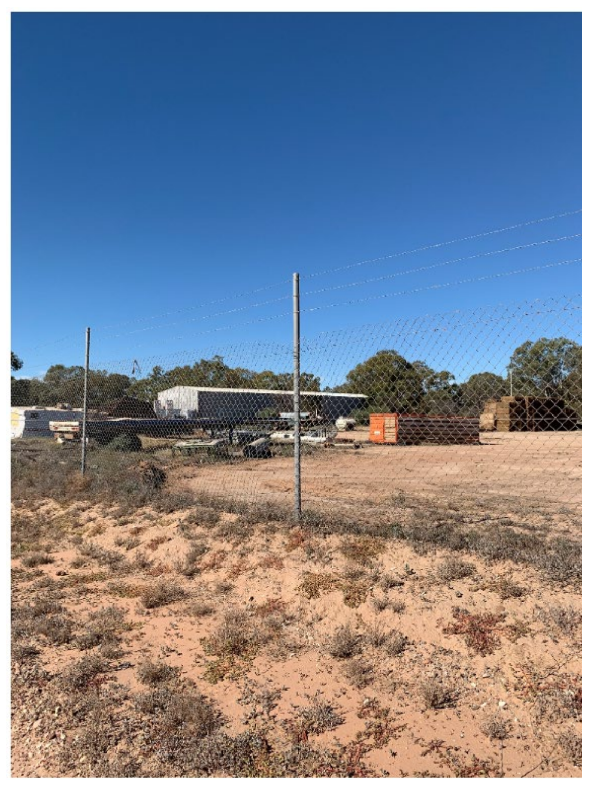
Site photo from the 5-19 Wilson Street Wilcannia May 2021