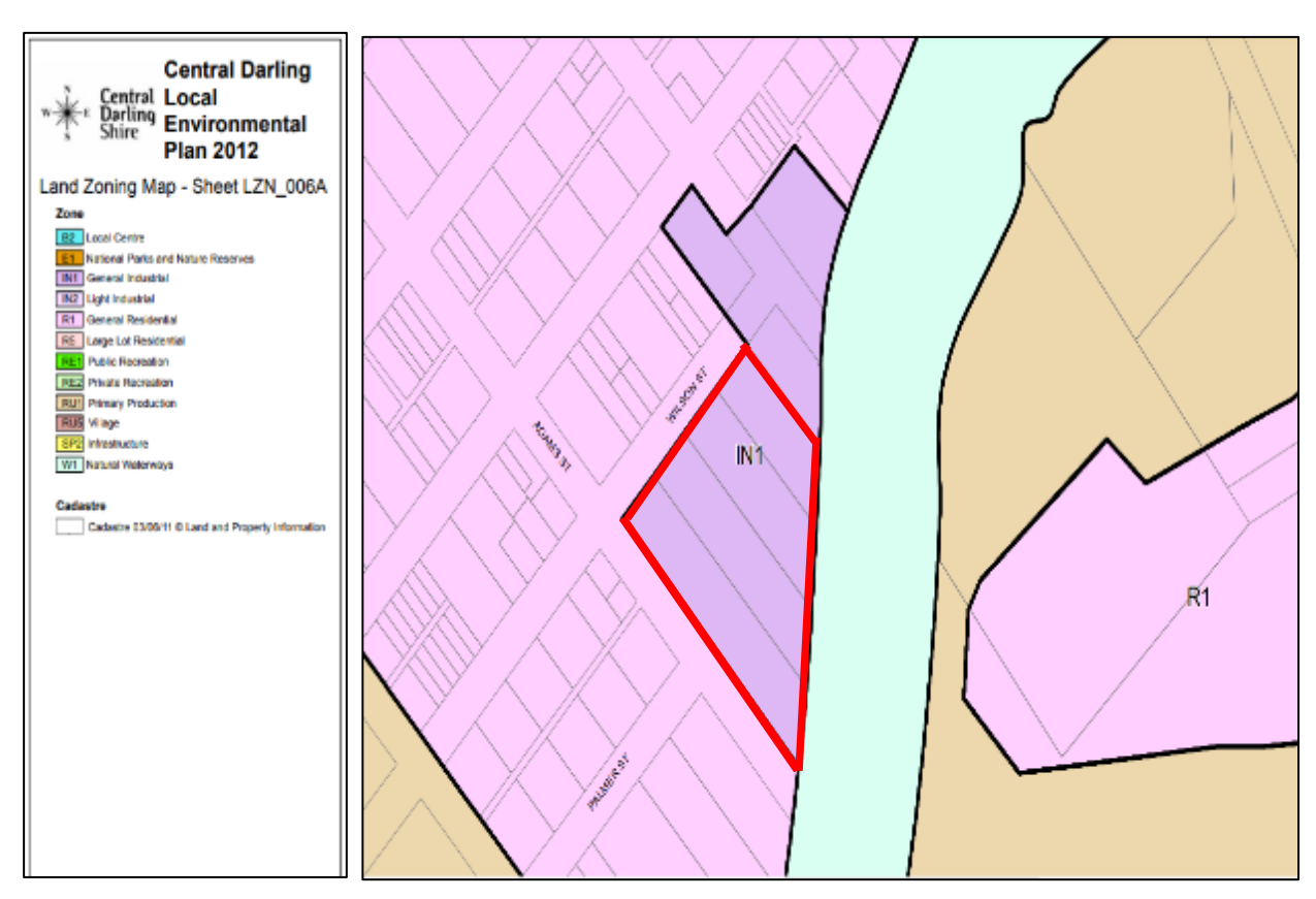
Figure 5-19 Wilson Street Wilcannia (source: Central Darling LEP 2012 zone map).