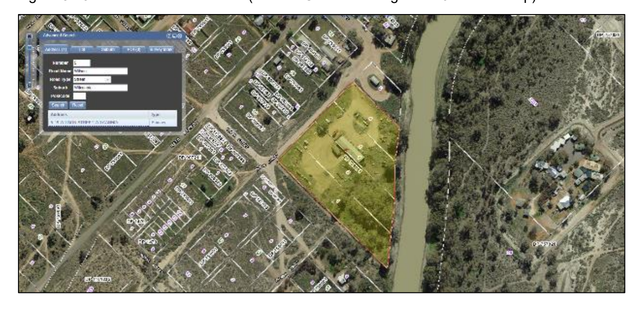
Figure 5-19 Wilson Street Wilcannia.