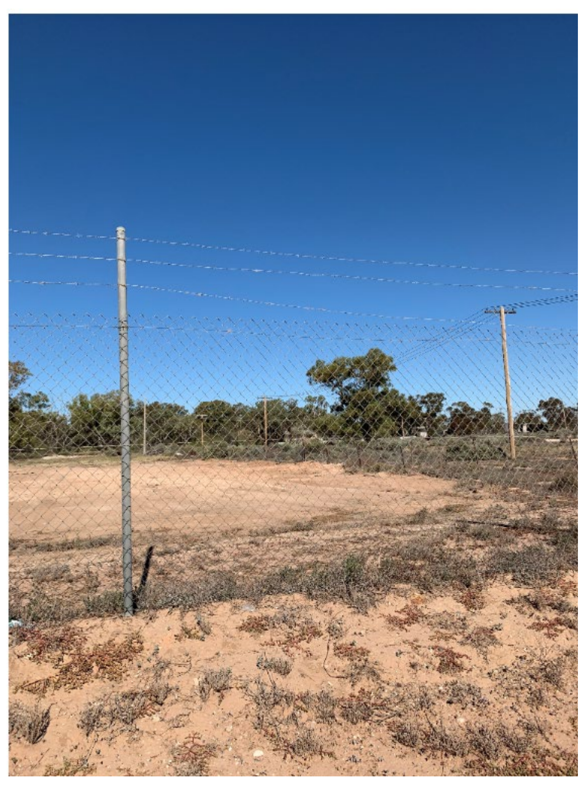
Site photo from the 5-19 Wilson Street Wilcannia Wilcannia May 2021