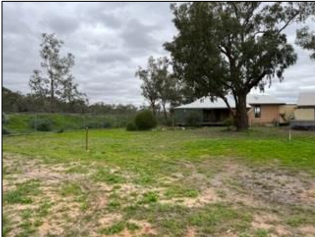
Photo 12: Site photo- Lot 3711 DP 766094, - 3711 Warralli Avenue Wilcannia NSW 2836 (CDSC 2022)