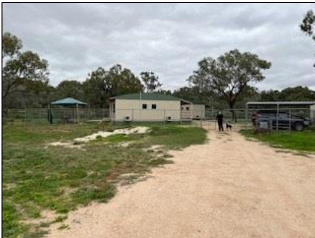
Photo 7 Site photo- Lot 3711 DP 766094, - 3711 Warralli Avenue Wilcannia NSW 2836 (CDSC 2022)