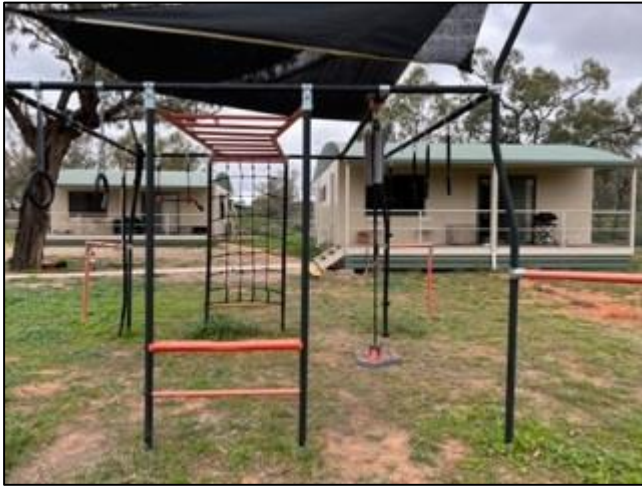
Photo 15: Site photo- Lot 3711 DP 766094, - 3711 Warralli Avenue Wilcannia NSW 2836 (CDSC 2022)