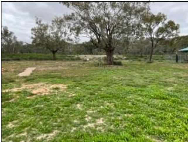
Photo 5 - location of a dwelling -Site photo- Lot 3711 DP 766094, - 3711 Warralli Avenue Wilcannia NSW 2836 (CDSC 2022)