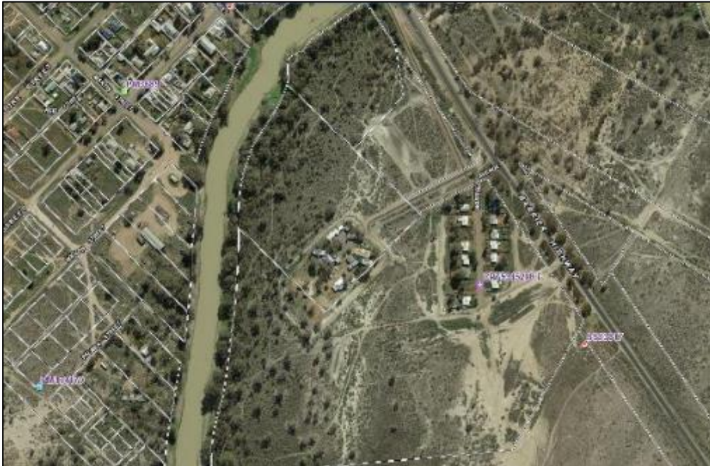
Photo 1: Lot 3711 DP 766094, - 3711 Warralli Avenue Wilcannia NSW 2836.