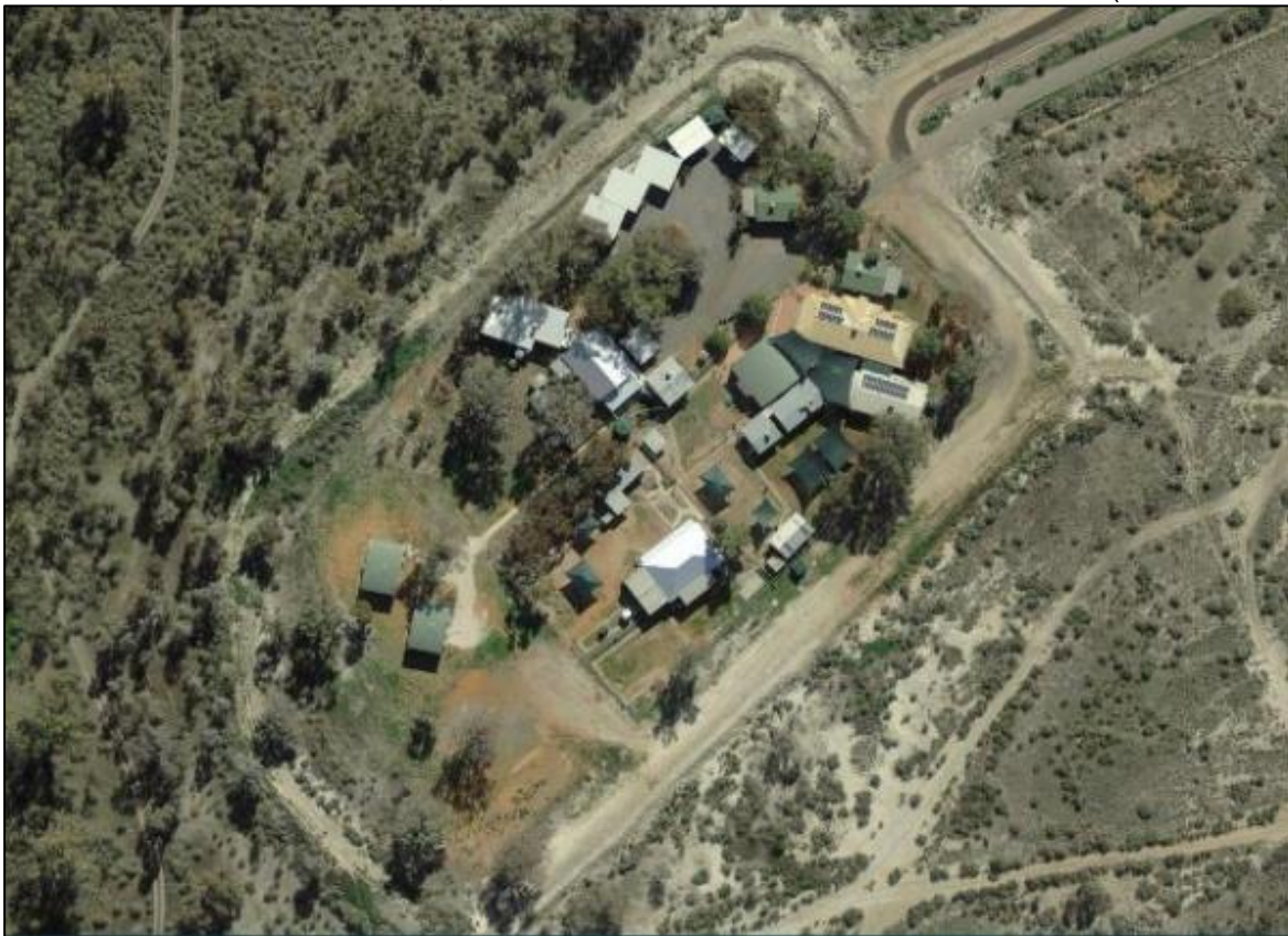
Photo 2: - Lot 3711 DP 766094, - 3711 Warralli Avenue Wilcannia NSW 2836.

Delegated report: DA 04 2022 3711 Warrali Avenue Wilcannia June 2022.