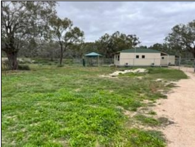
Photo 6 Site photo- Lot 3711 DP 766094, - 3711 Warralli Avenue Wilcannia NSW 2836 (CDSC 2022)