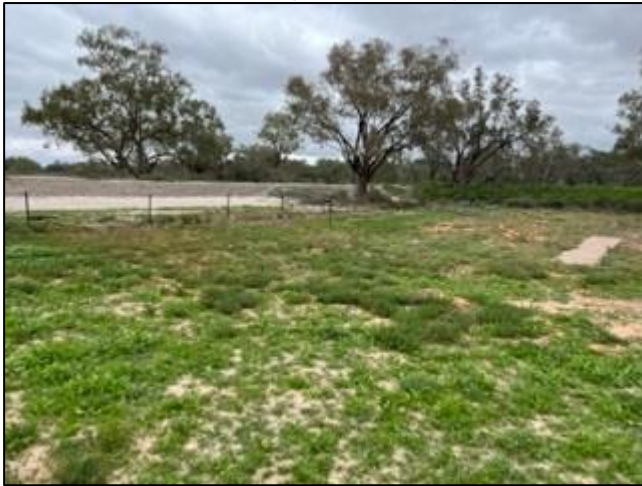
Photo 4 location of a dwelling - Site photo- location of dwelling - Lot 3711 DP 766094, - 3711 Warralli Avenue Wilcannia NSW 2836 (CDSC 2022)