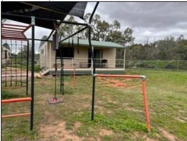
Photo 13: Site photo- Lot 3711 DP 766094, - 3711 Warralli Avenue Wilcannia NSW 2836 (CDSC 2022)