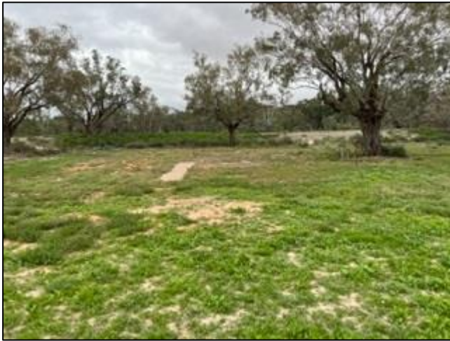
Photo 3; location of a dwelling - Site photo- Lot 3711 DP 766094, - 3711 Warralli Avenue Wilcannia NSW 2836 (CDSC 2022)