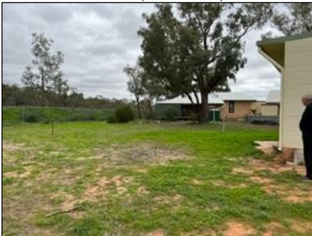
Photo 10 Site photo- Location of a dwelling - Lot 3711 DP 766094, - 3711 Warralli Avenue Wilcannia NSW 2836 (CDSC 2022)