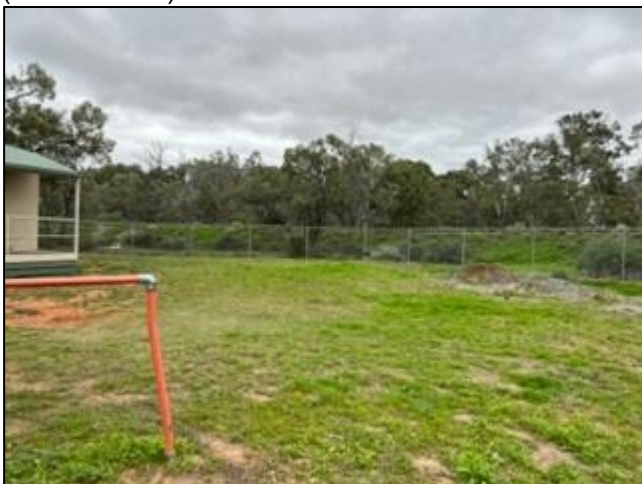
Photo 14: Site photo- Lot 3711 DP 766094, - 3711 Warralli Avenue Wilcannia NSW 2836 (CDSC 2022)