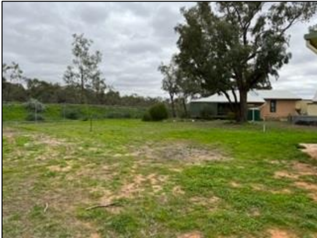
Photo 9: location of dwelling: Site photo- Lot 3711 DP 766094, - 3711 Warralli Avenue Wilcannia NSW 2836 (CDSC 2022)