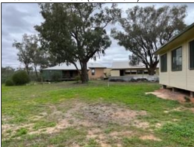
Photo 11 : Site photo- Lot 3711 DP 766094, - 3711 Warralli Avenue Wilcannia NSW 2836 (CDSC 2022)