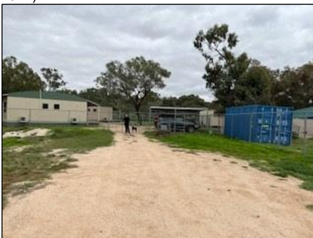
Photo 8 Site photo- Lot 3711 DP 766094, - 3711 Warralli Avenue Wilcannia NSW 2836 (CDSC 2022)