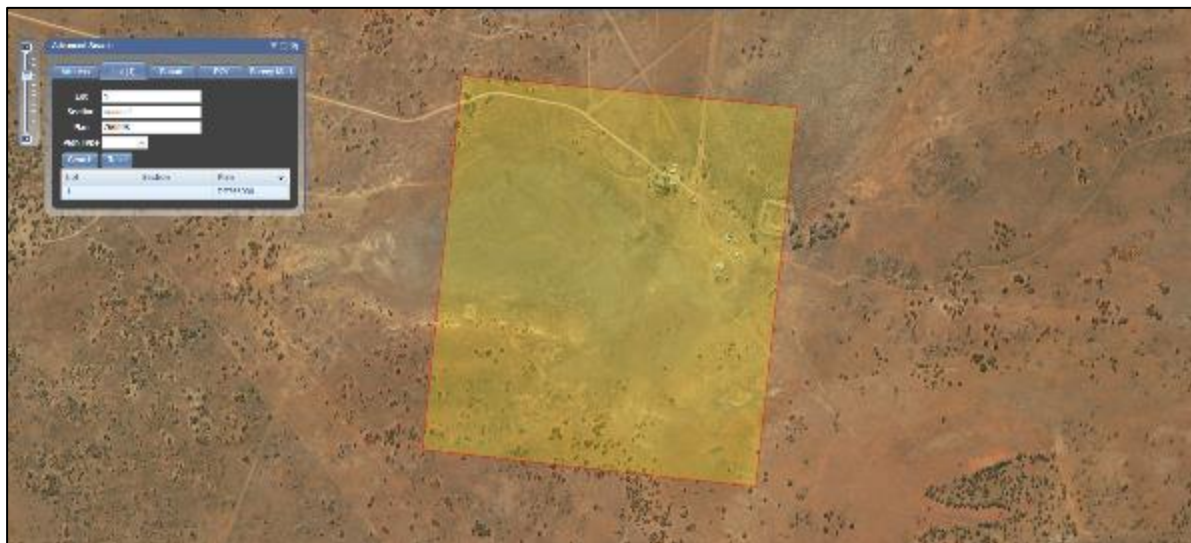
Extract from 6 maps of site Lot 1 in DP 756998