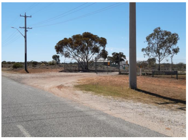
Figure 5 Existing driveway access to the north portion of lot