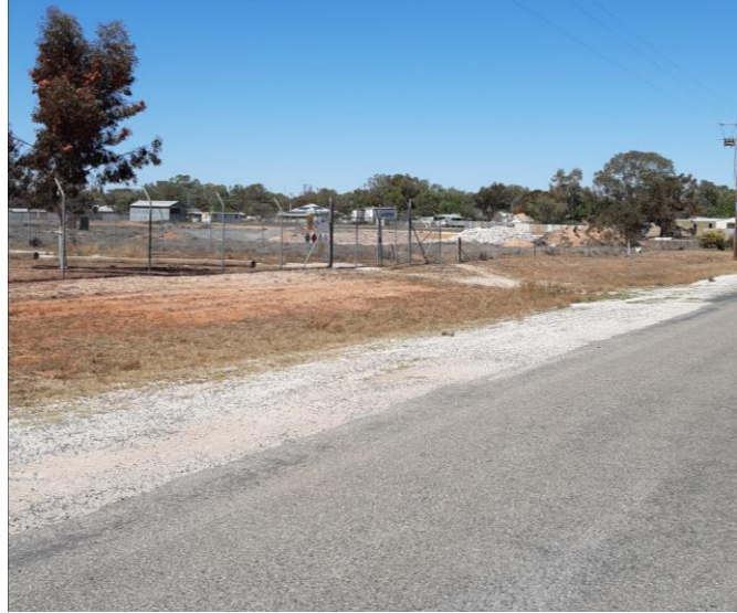
Figure 7 Woore Street frontage of the land