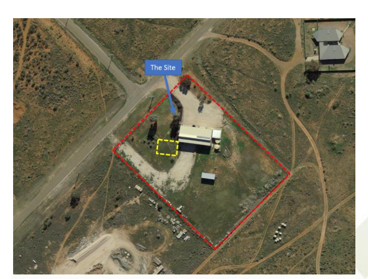
Figure 3 Aerial image of the site

The figures below, site context and plans illustrate existing developments at the site and the immediate surroundings. The immediate area of the site is a general residential zone with private roads.