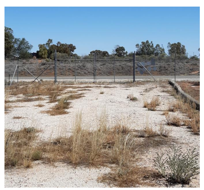
Figure 6 Existing driveway access to the west portion of lot