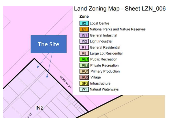
Figure 1 Zone Map

In accordance with the Wakool LEP zoning maps the land is contained within zone W1 Zone – Waterways.