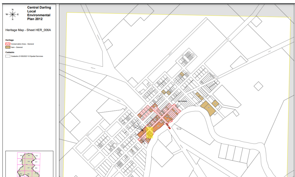
Figure 5: The Central Darling LEP 2012 Heritage Map – Wilcannia. 65-67 Reid St is highlighted

The site is situated within the well-established Wilcannia township amongst several local Heritage listed buildings as recognised in the Central Darling Local Environmental Plan 2012 . The Reid St property is located opposite the Courthouse and Barker park, with the Baaka (or Darling) River running behind the property in the Central Darling Shire Council area, in Far West NSW.