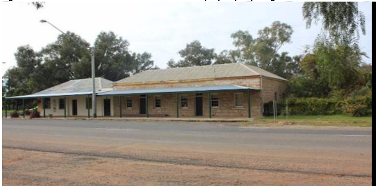
Figure 4: 65-67 Reid St Wilcannia NSW for context of property requiring refurbishments.

The subject site is located on 65-67 Reid St Wilcannia NSW 2836 and the combined site area is 2899.7m 2 . The site has a frontage width on Reid Street Wilcannia. The site is a flat area of land.