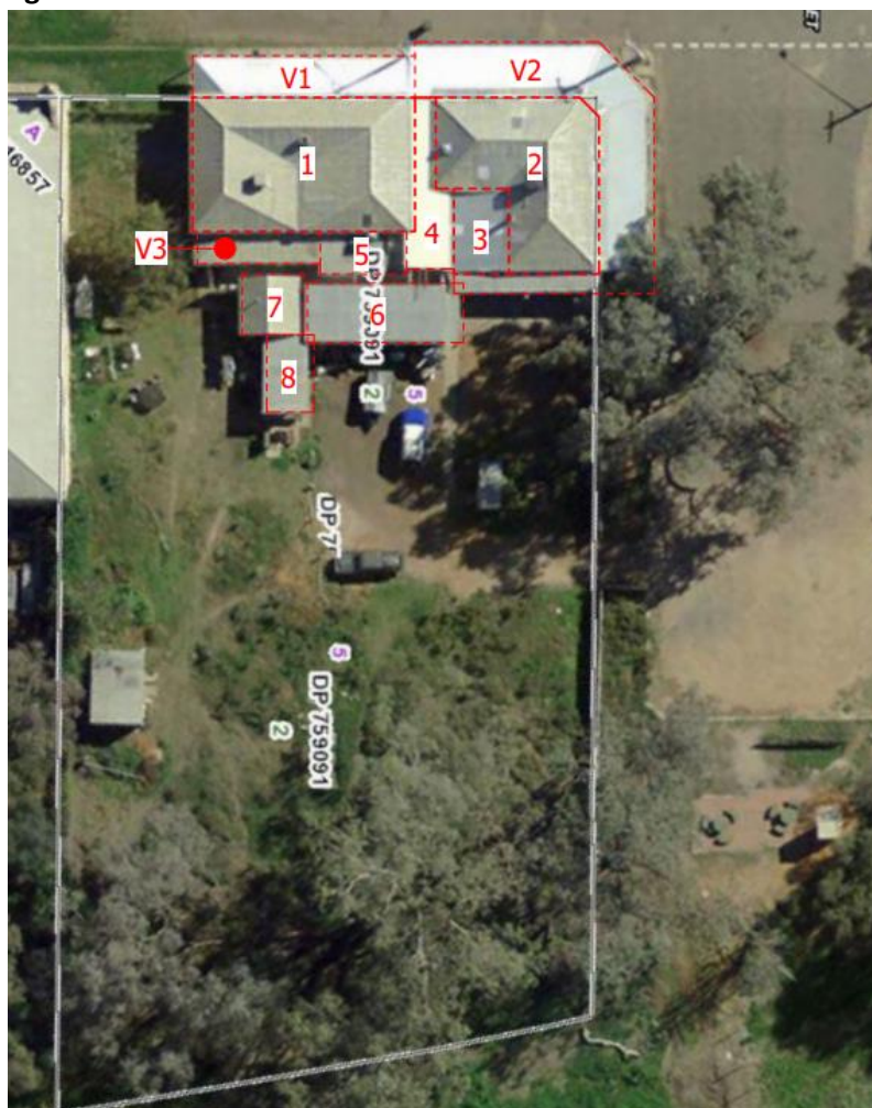
Figure 1: Aerial of site

The subject lot is located within the town of Wilcannia NSW.