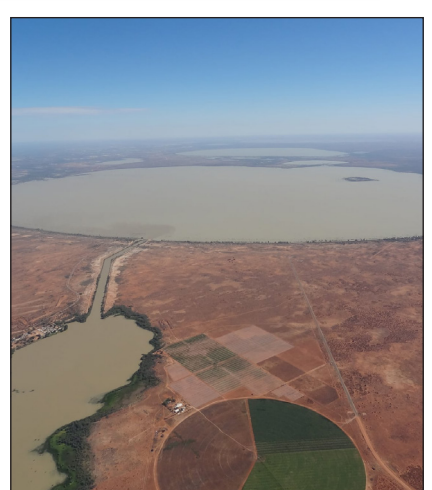
Flooding Photos courtesy the SES.