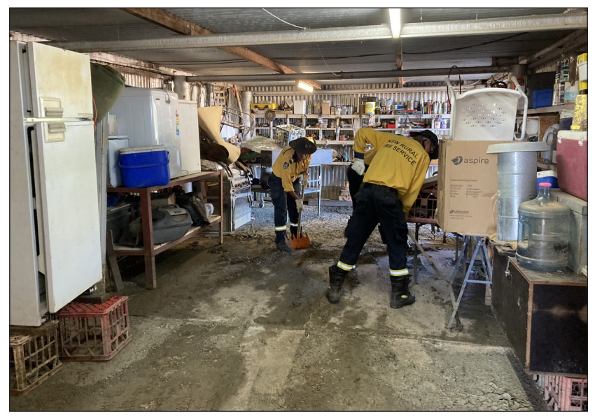
Clean-up is ongoing in Menindee. The Rural Fire Service are assisting with the recovery work.

https://disasterassistance.service.nsw.gov.au