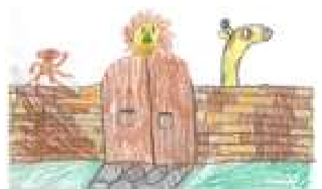
Town improvement ideas by students from White Cliffs Public School.