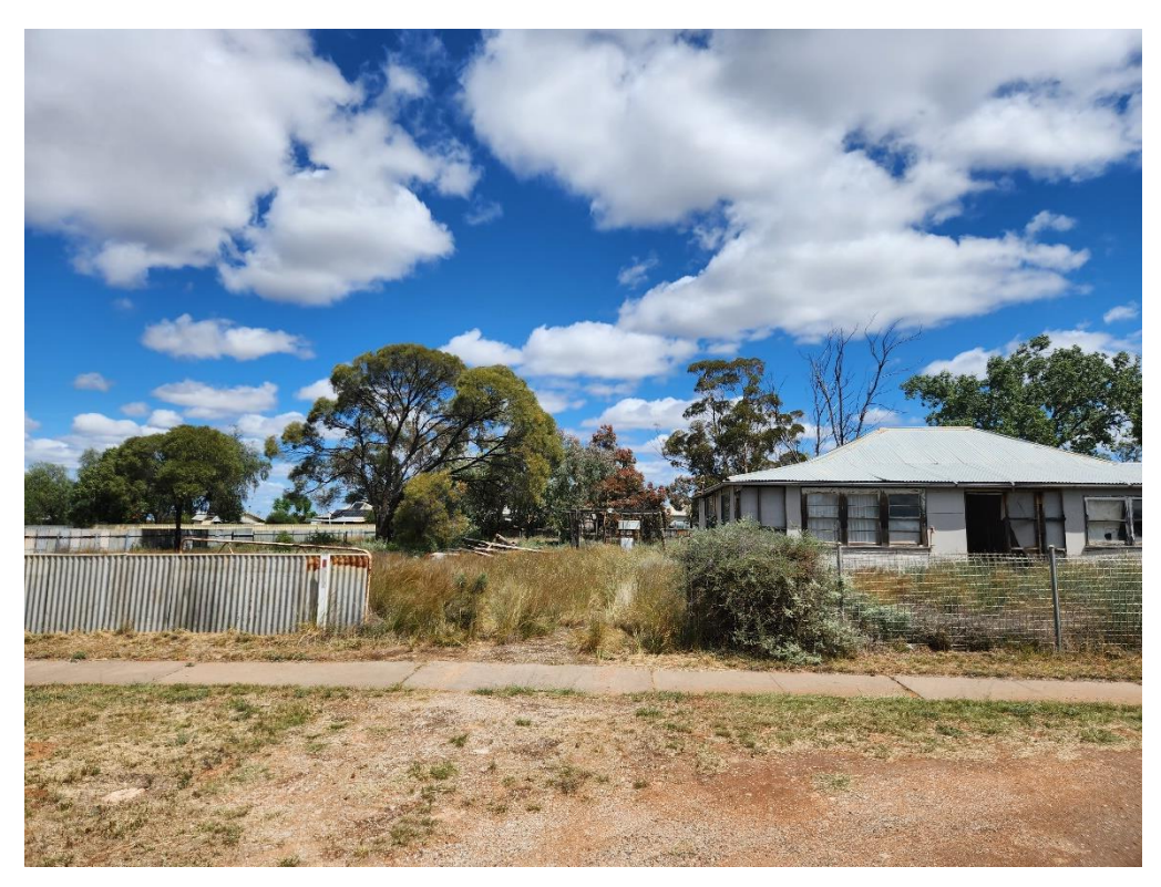
Plate 1 – West facing view

Any trees noted to be within the building zone, should be removed and the excavation remaining should be backfilled with natural material and reinstated in layers to a minimum of 95% Standard Maximum Dry Density