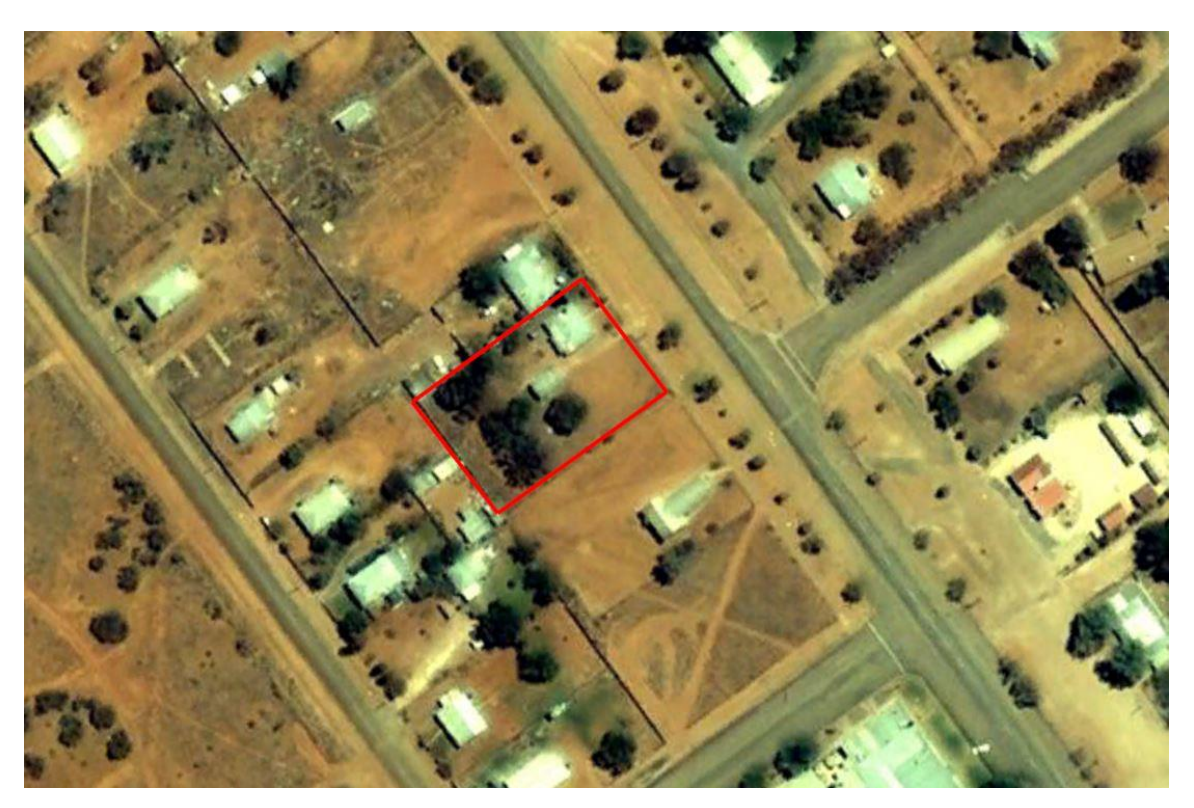
Plate 2 – Aerial Image 2002, Courtesy Google Earth.

A review of Google Earth imagery of the site indicates that the site is in similar condition as to when an image was taken in 2002. The site is therefore assumed to be natural ground with no recent tree removal or fill placed. Images exist back to 1985, yet the image is not clear enough to determine what was on the site. See 2002 aerial image below: