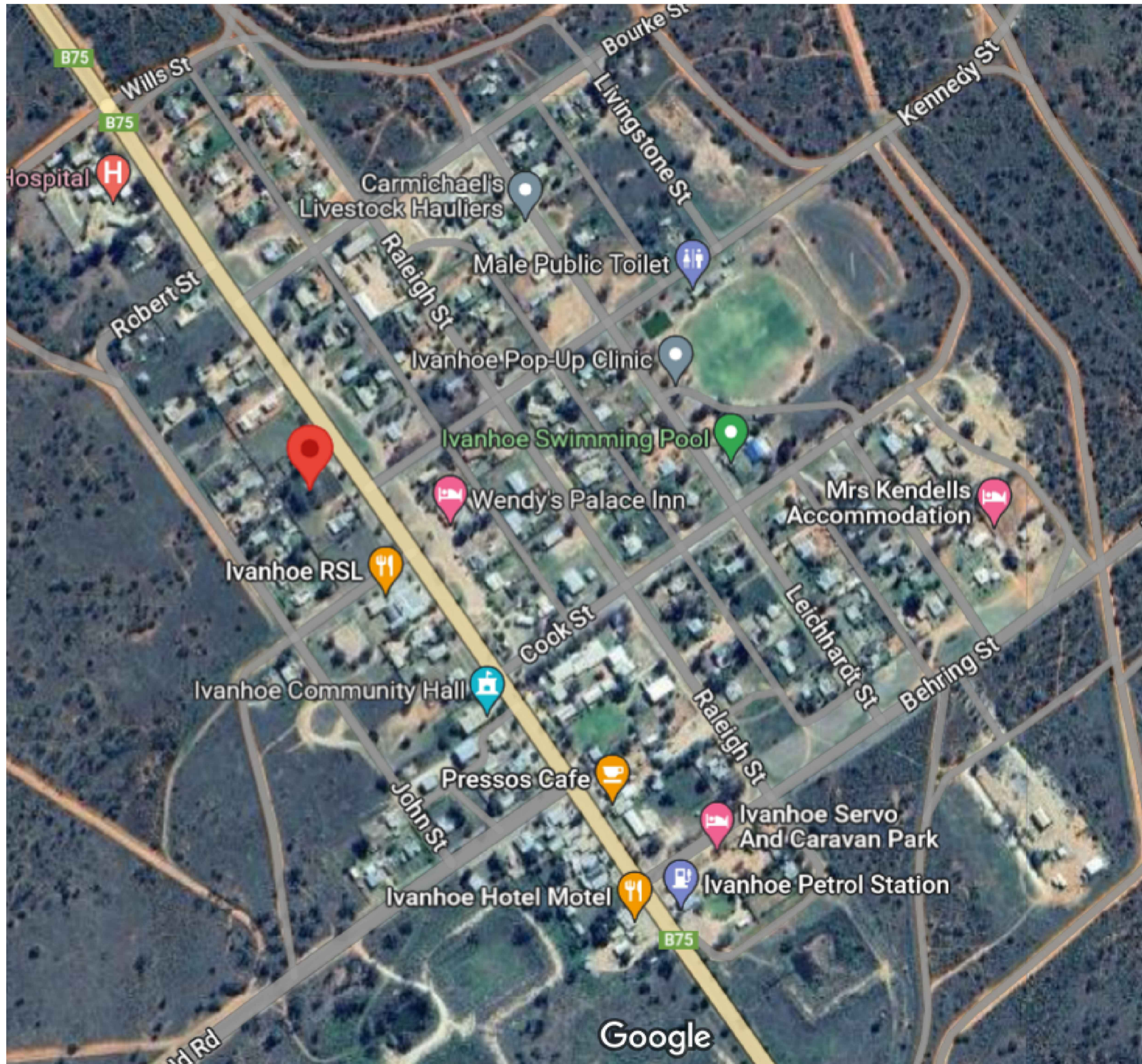
Locality Plan (NTS)