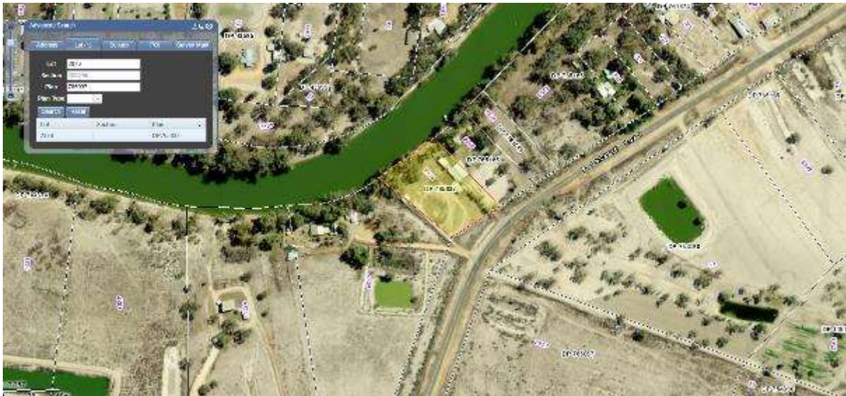
Figure 2: six maps aerial view of the site on the Darling River .