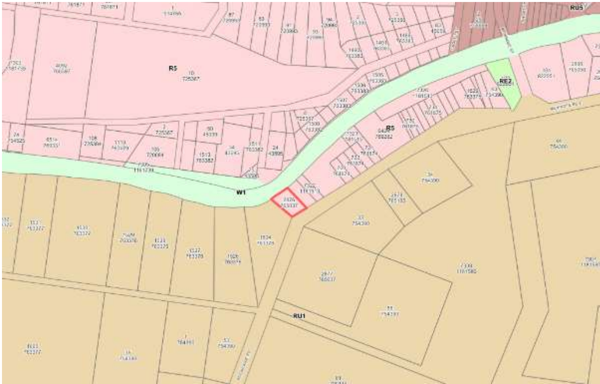
Figure 1: Extract from zone R5 Village zone