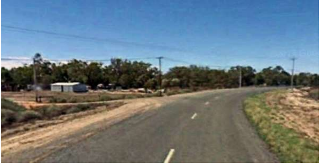
Figure 3:Pooncarie Rd Google Street view