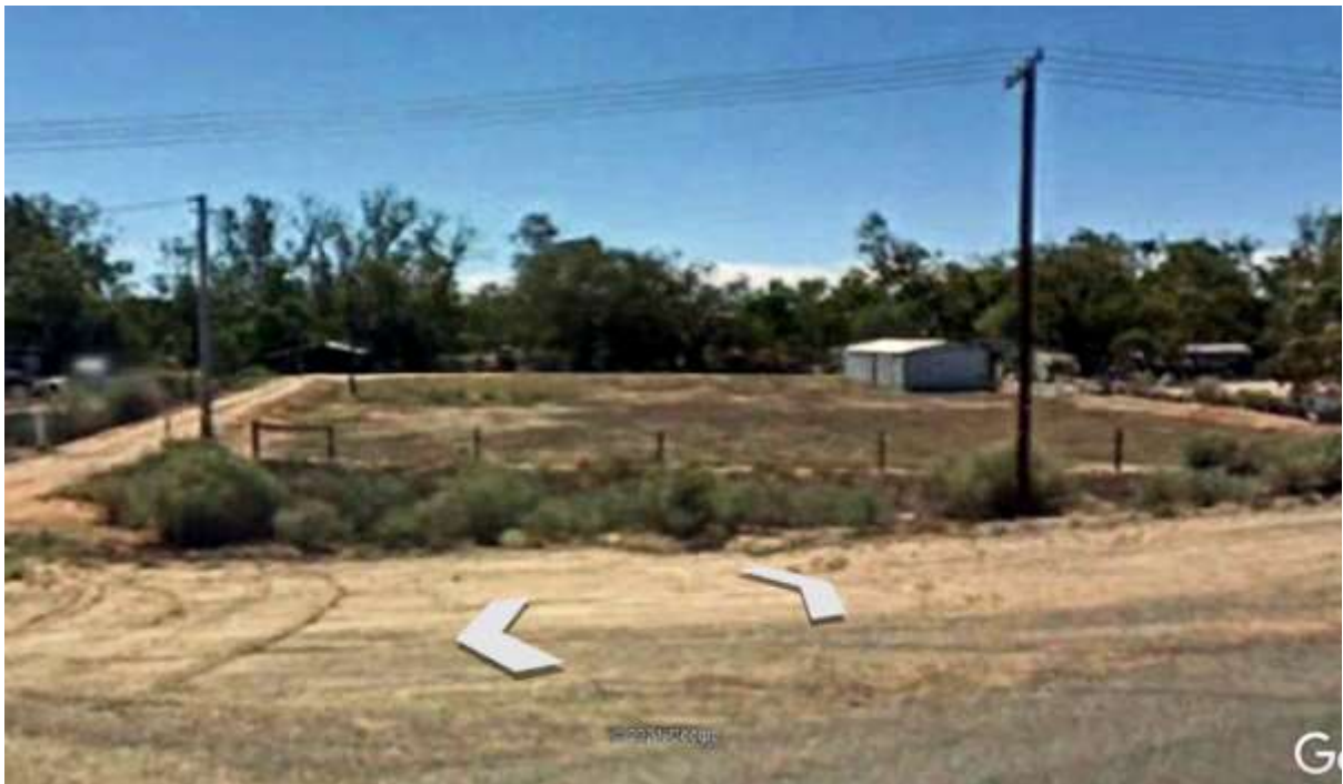
Figure 4: Photo of Lot 2876 in DP 765037 from Pooncarie Rd looking north west