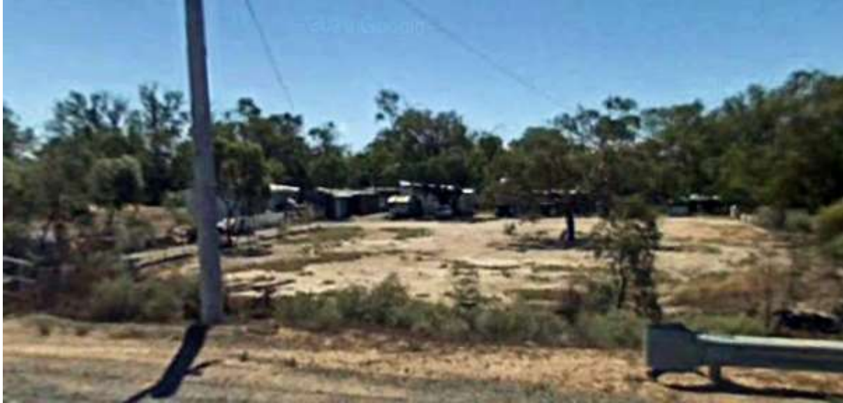
View of adjoining site looking north west