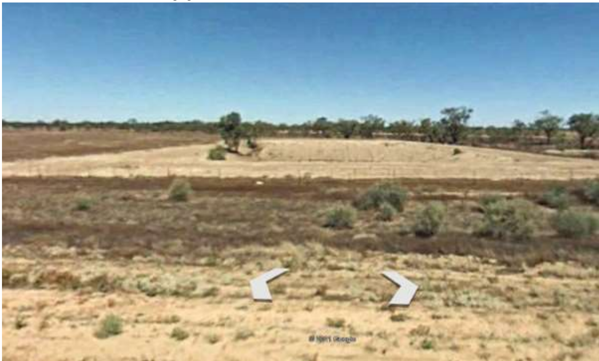
Water Dam opposite the site Pooncarie Road Menindee: Google Street Street View