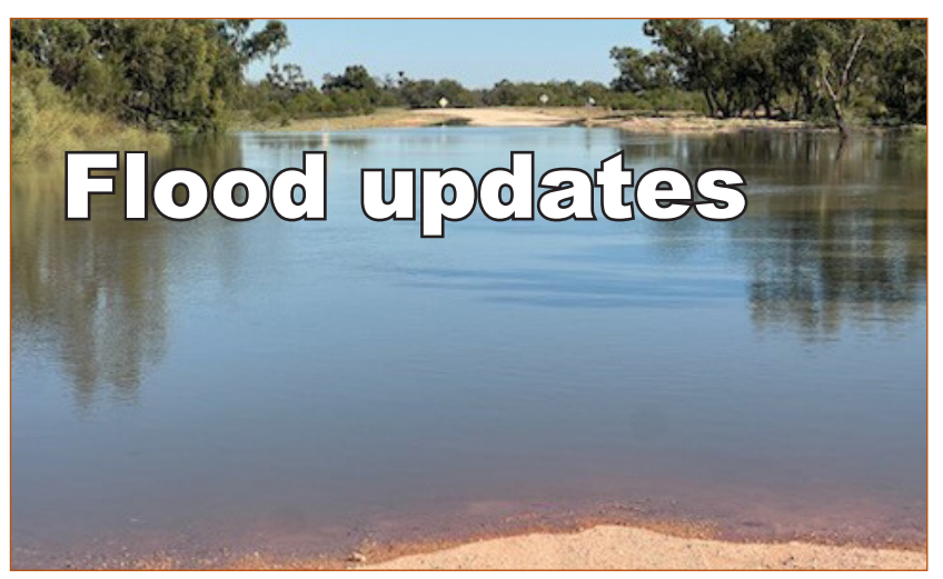
For the latest flood updates and advice people should keep up to date with information from the SES as they are the combat agency. There are links to the SES and further information on Council's website homepage. Council is hoping that Natural Disaster Declaration Assistance will be fast tracked to assist communities immediately as required.