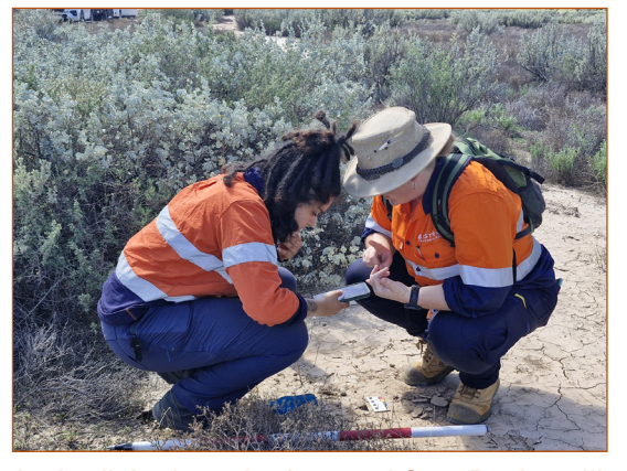
In April Archaeologists and four Barkandji representatives investigated potential sites for the groundwater bore at Wilcannia.

A hearth and grinding stone were found at the other site, however these are at the edge of the area surveyed and can be avoided during test drilling The department is waiting on a formal report from the archaeologists. In the meantime, the department is organising for test drillers to confirm the presence of suitable groundwater.