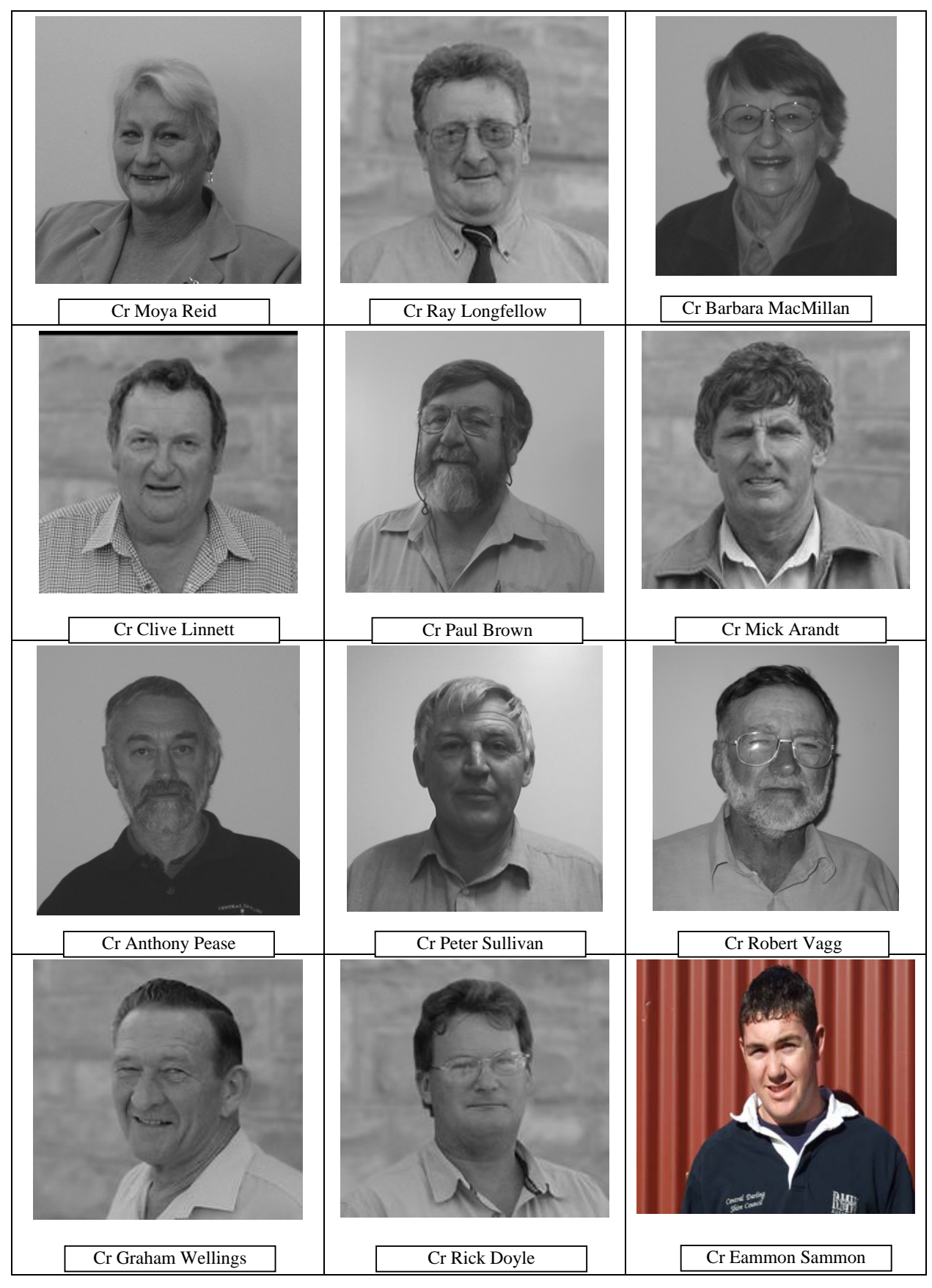
Central Darling Shire / NSW Australia